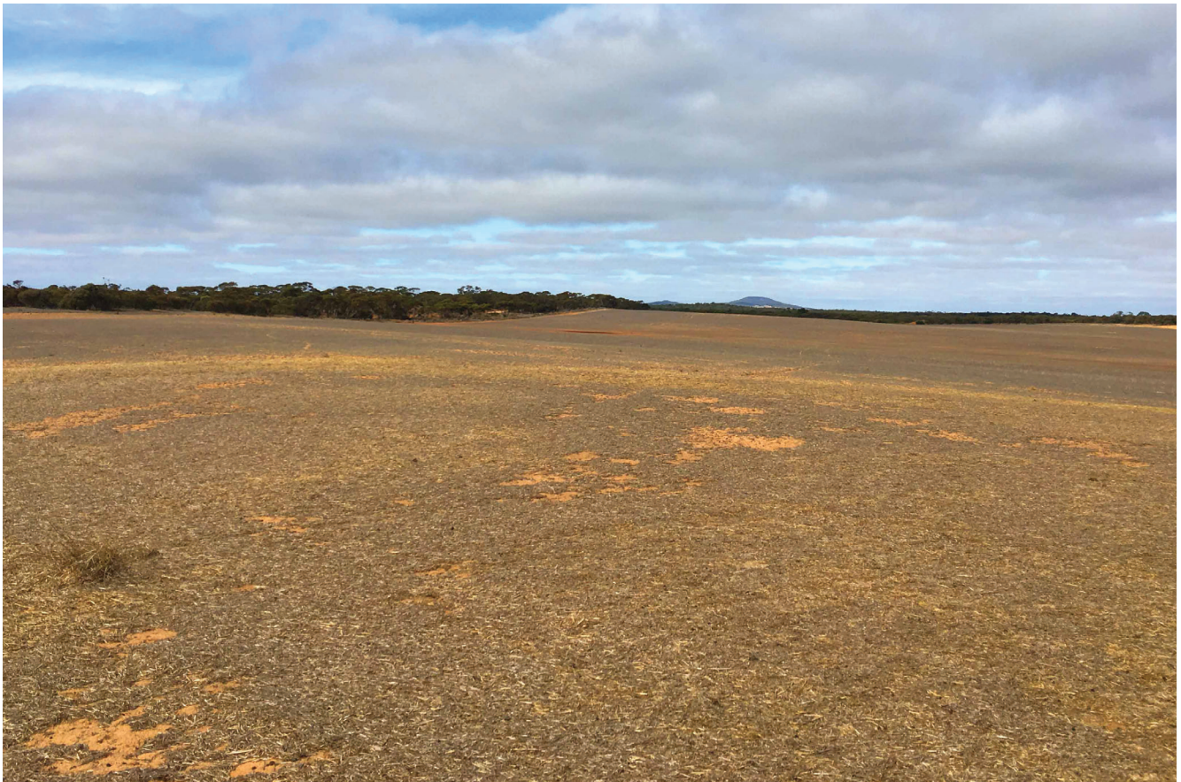
Undulating landscape at the Napandee nominated site