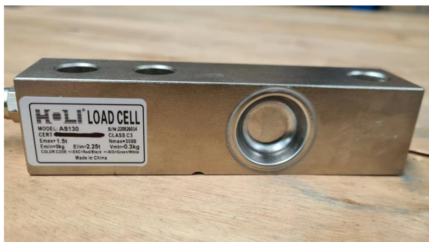
Holi Scale AS130 Series Load Cell