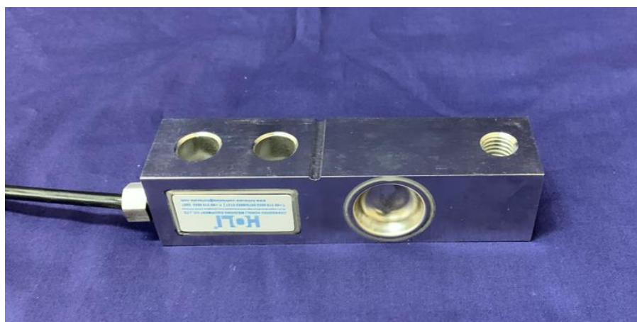
Holi Scale SS130 Series Load Cell