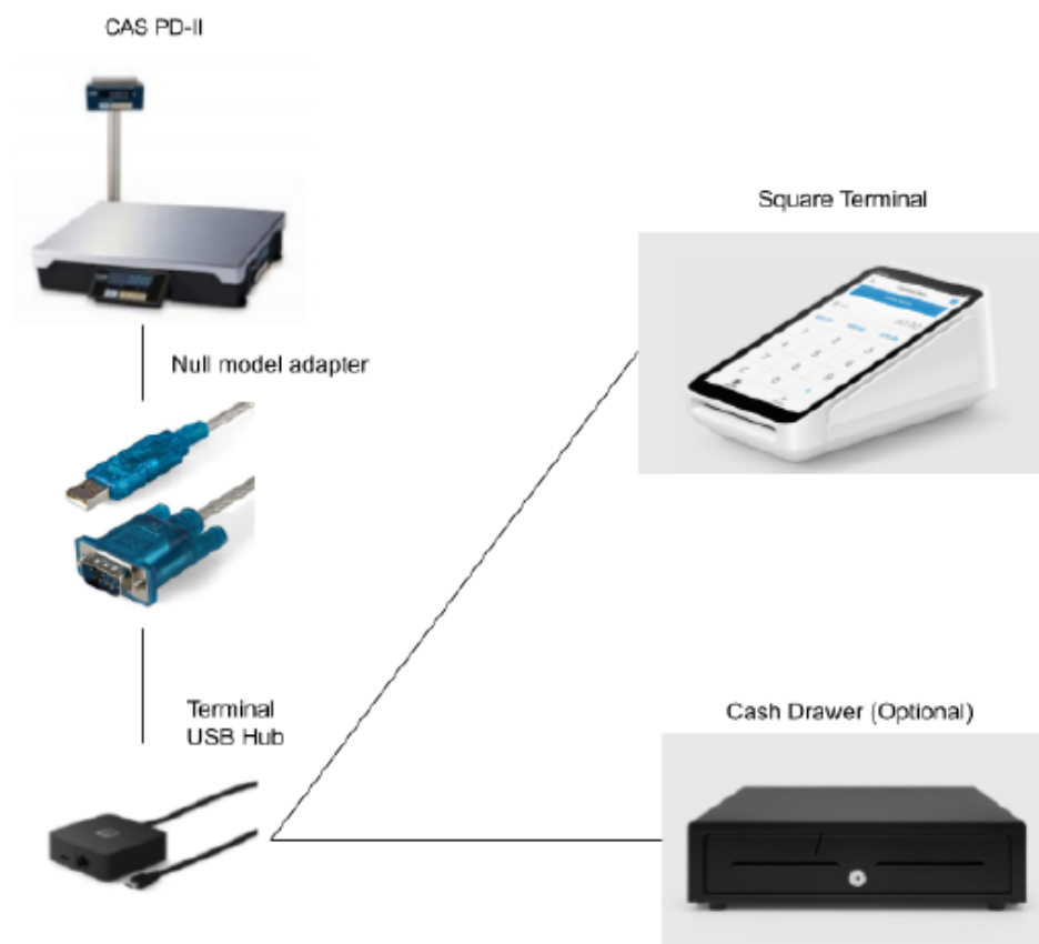
Square AU model Square Point of Sale (POS) System