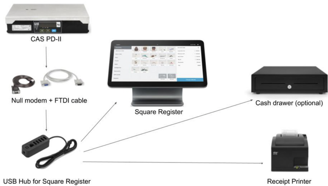
Square AU model Square Register Point of Sale (POS) System – Variant 2