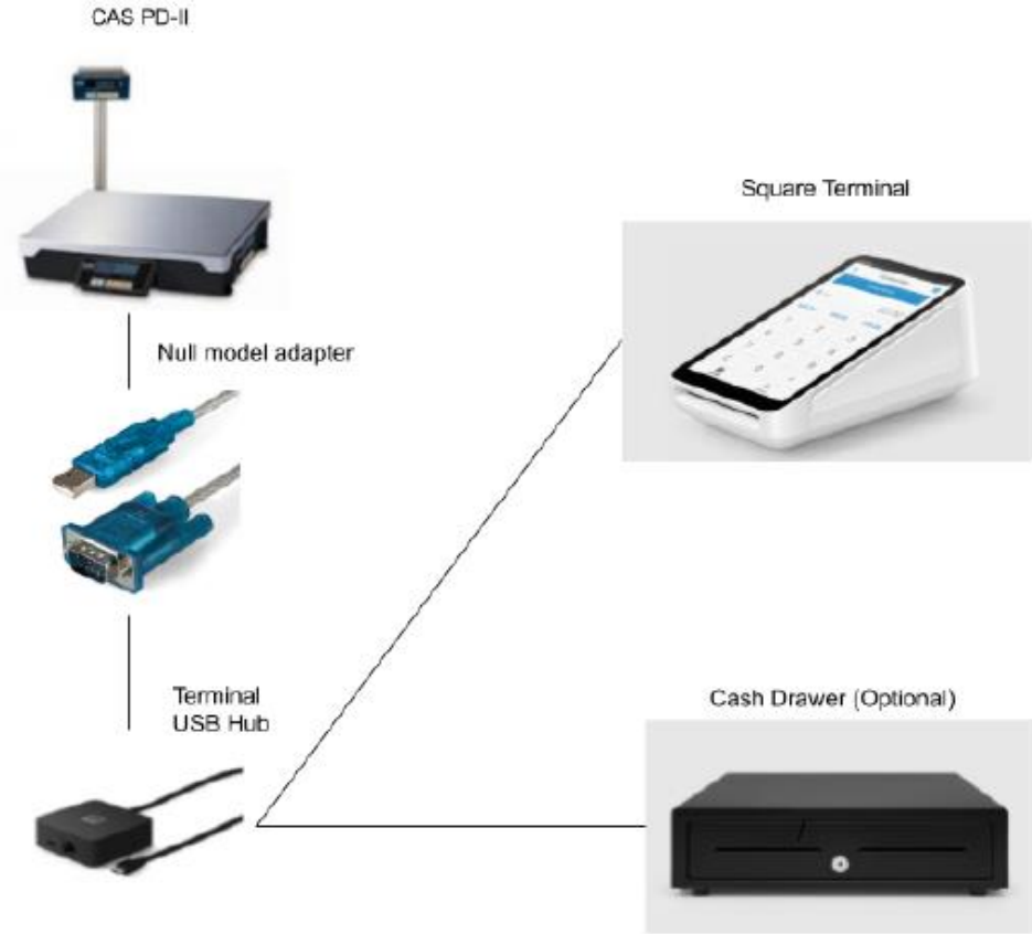
Square AU model Square Point of Sale (POS) System