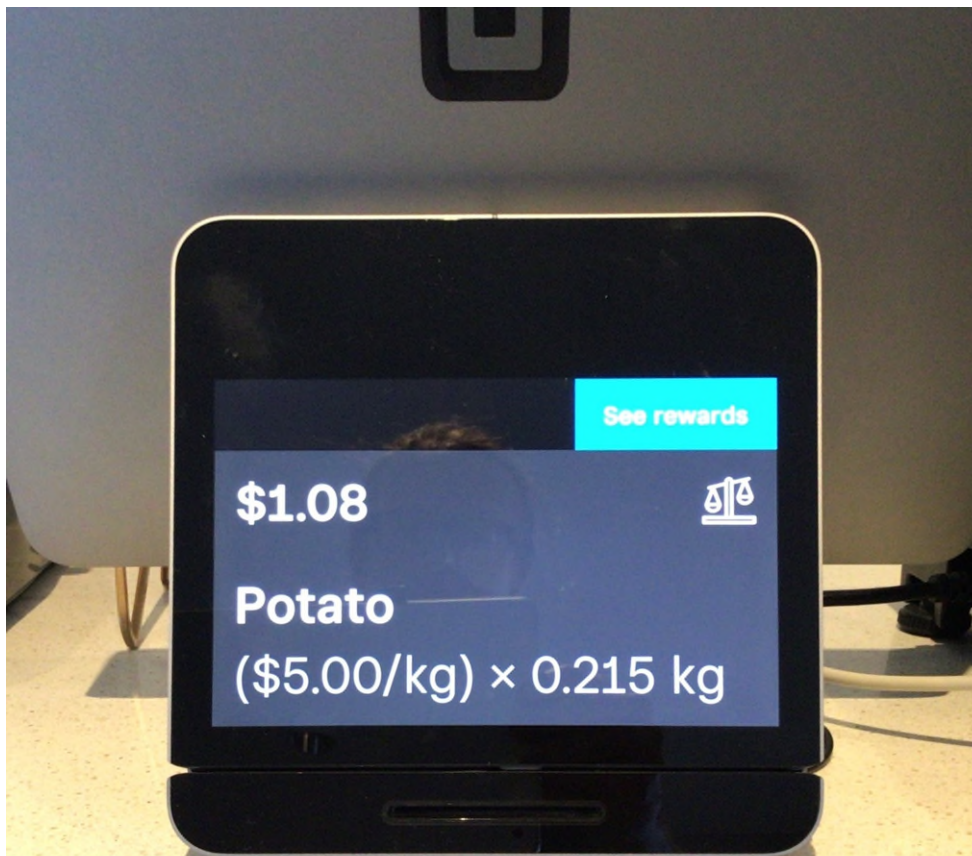
Square Register Typical Customer Display – Variant 2