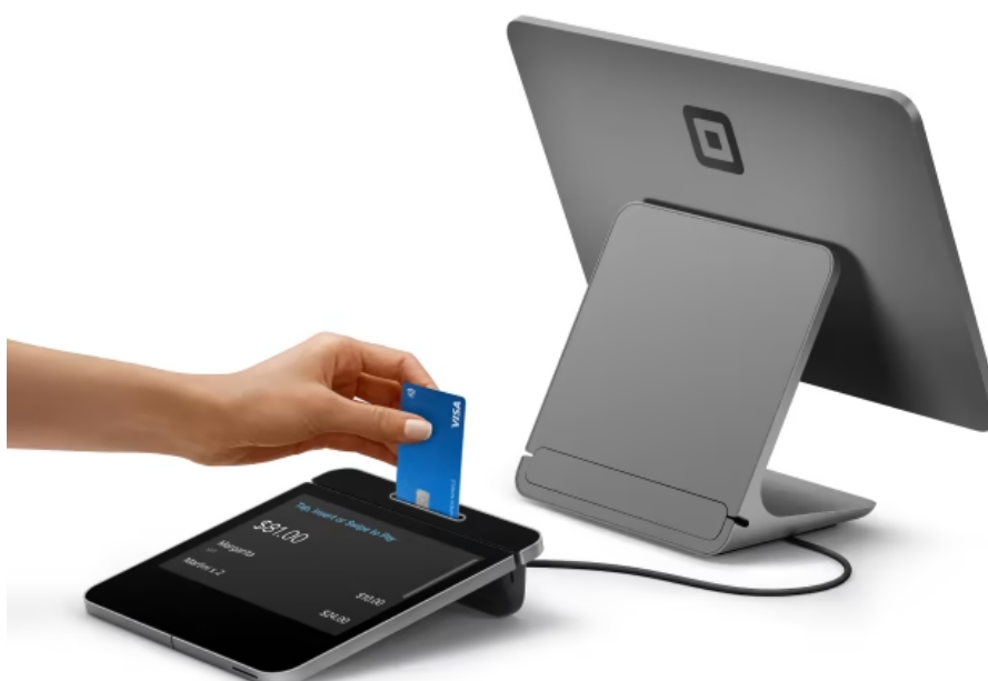
Square Register Typical Customer Display – Variant 2