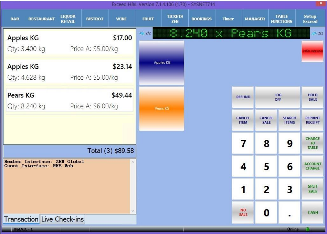
Typical Operator Display