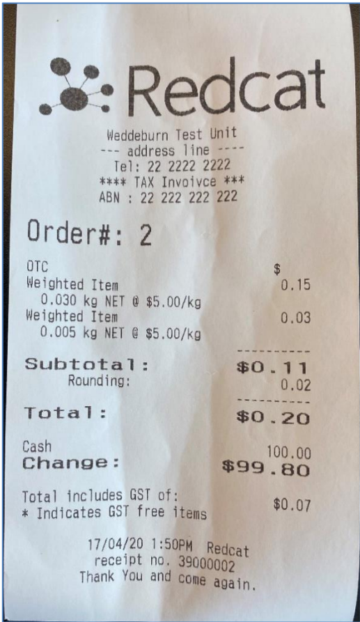
A Typical Receipt

----- address line ----- Tel: 22 2222 2222 **** TAX Invoice *** ABN : 22 222 222 222 Order#: 2 OTC $ Weighted Item 0.15 0.030 kg NET @ $5.00/kg Weighted Item 0.03 0.005 kg NET @ $5.00/kg ----- Subtotal: $0.11 Rounding: 0.02 ----- Total: $0.20 Cash 100.00 Change: $99.80 Total includes GST of: $0.07 * Indicates GST free items 17/04/20 1:50PM Redcat receipt no. 39000002 Thank You and come again.