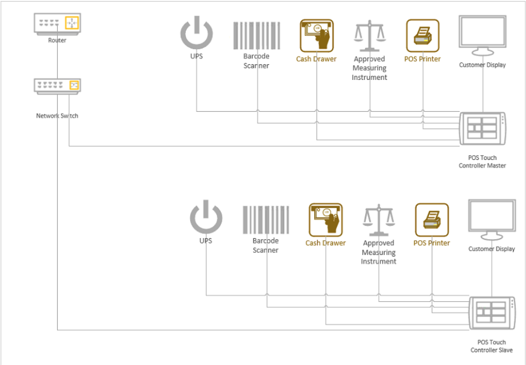
RedCat Premium model PT525 point of sale (POS) system