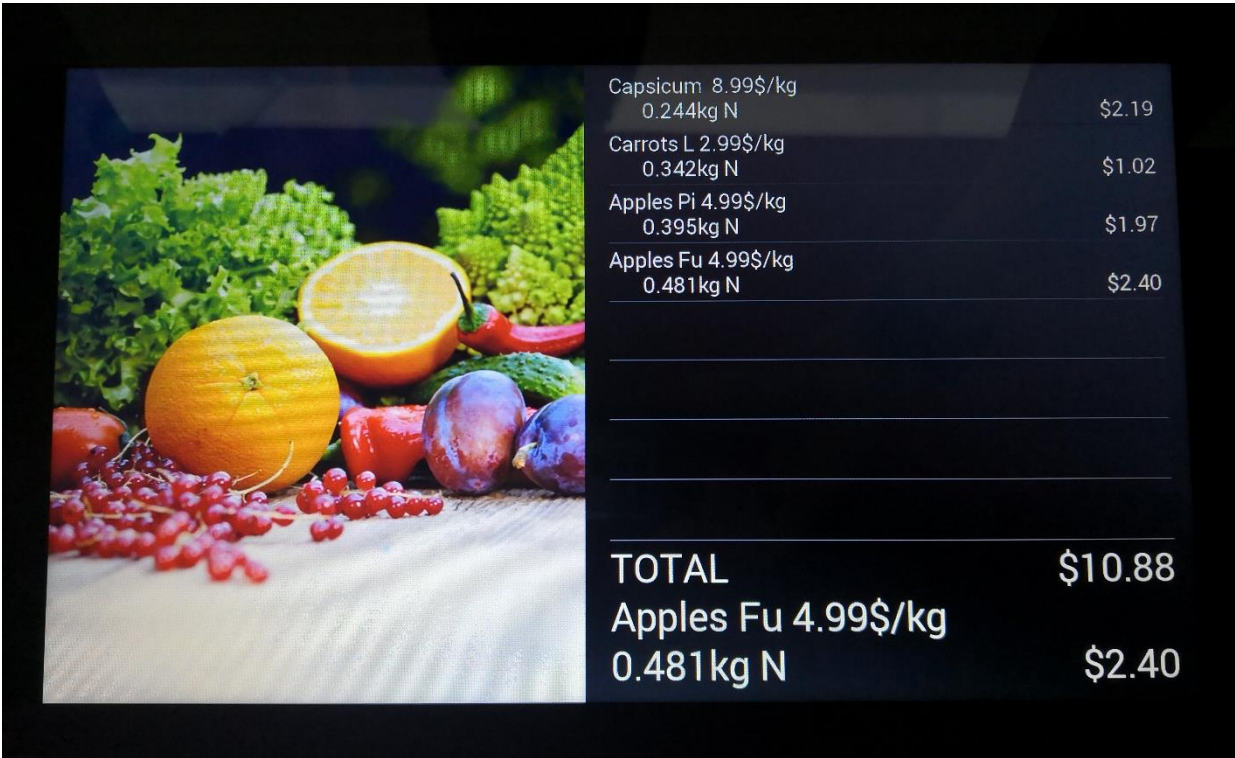
Typical Alternate Customer display