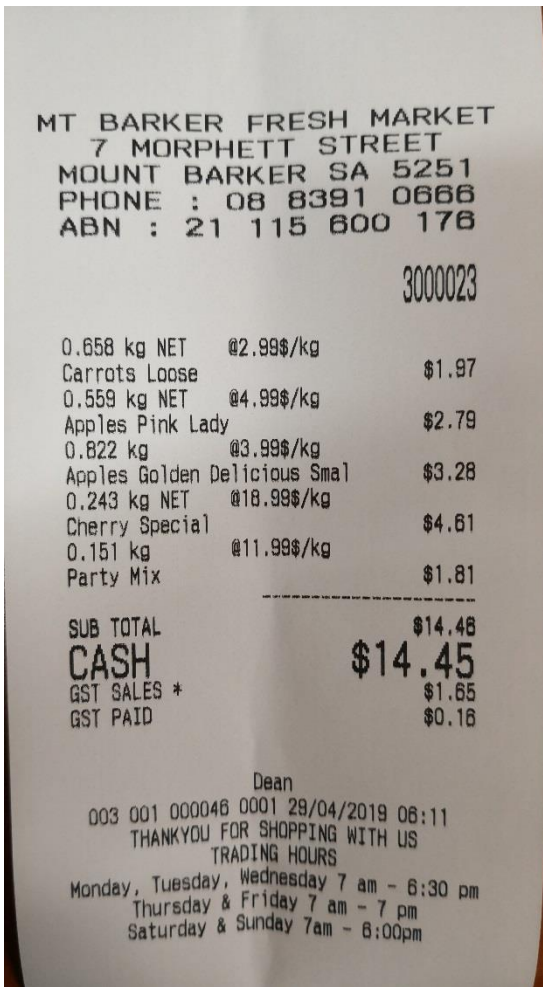
A Typical Receipt