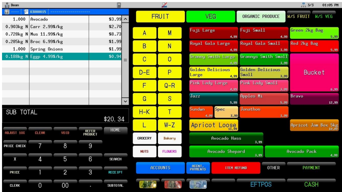
Typical Operator Screen