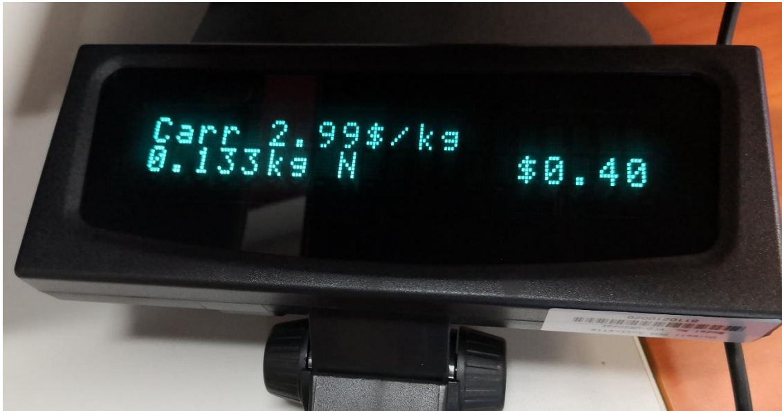
Typical Customer Display