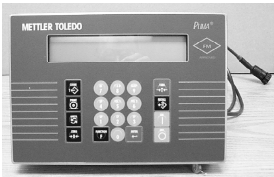
Mettler Toledo Model PUMA Digital Indicator