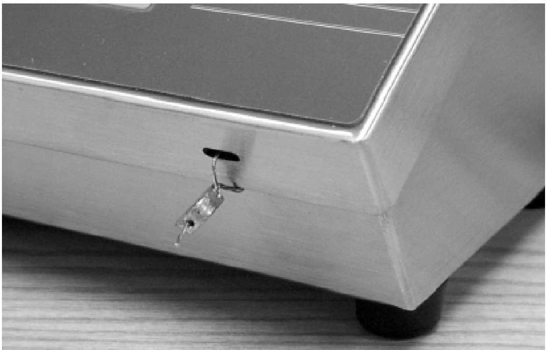
Showing A Sealing Method