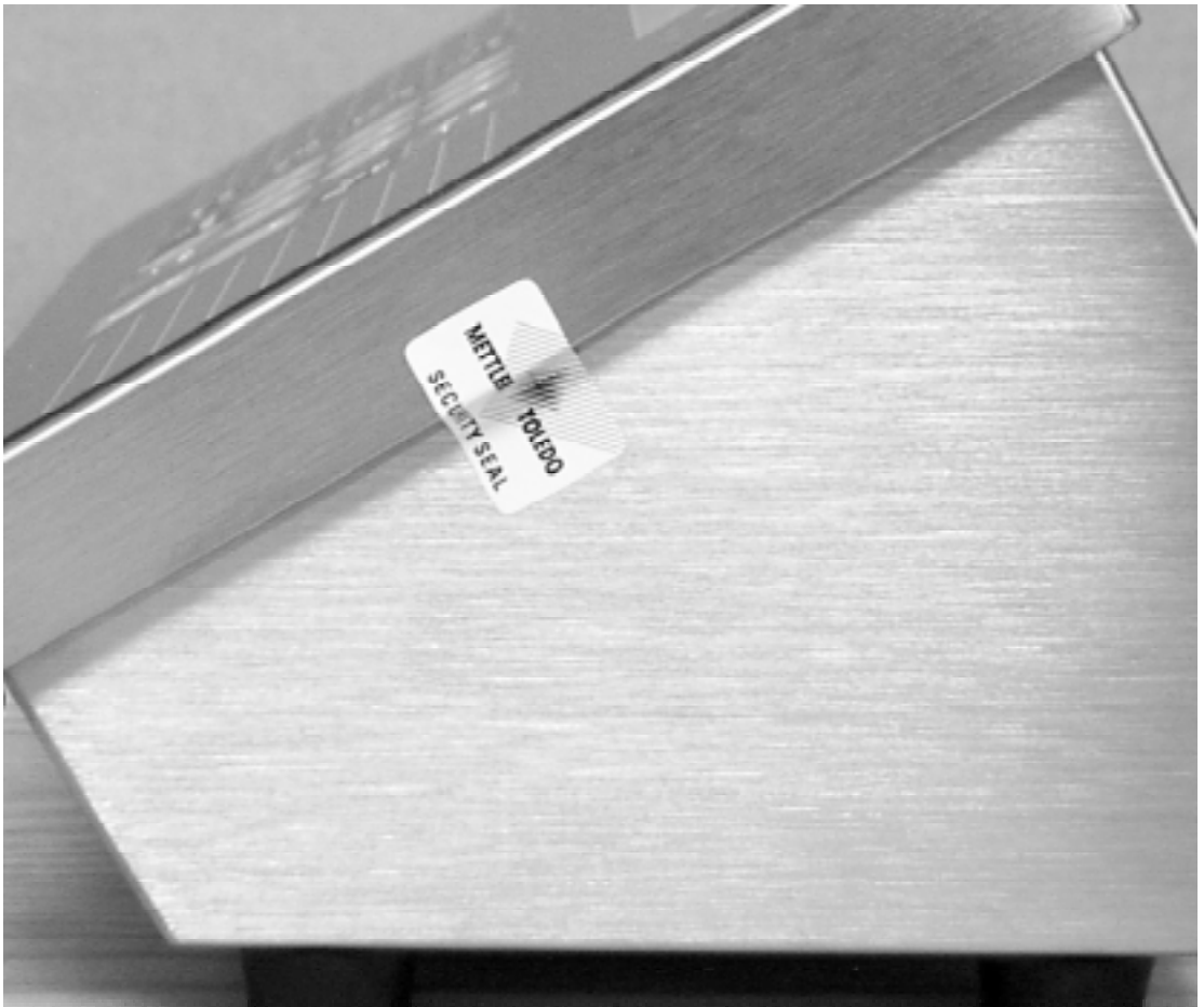
Showing An Alternative Sealing Method