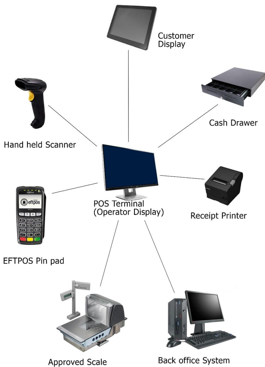
Univex model i-POS Point of Sale (POS) System