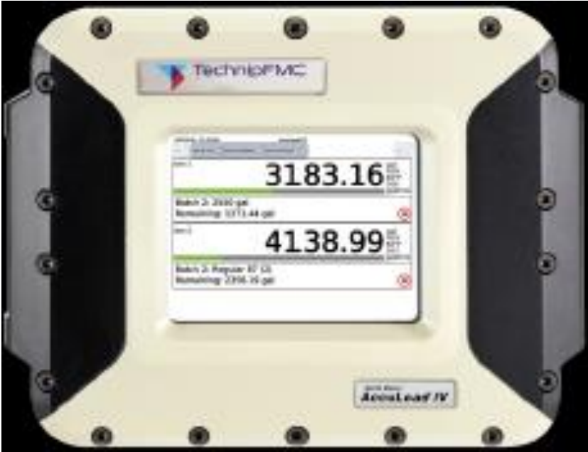
Smith Meter™ AccuLoad IV Model ALIV-ST Controller for Liquid-measuring Systems