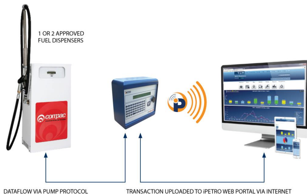
FIGURE S736 – 1