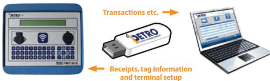
Petro Industrial Model iPETRO FMS LITE Control System (Variant 1)