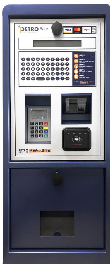
Petro Industrial Model iPETRO Bank Control System (Variant 2)