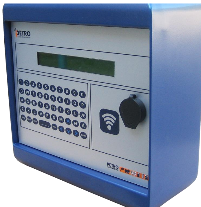
Petro Industrial Model iPETRO FMS PRO Terminal (Pattern)