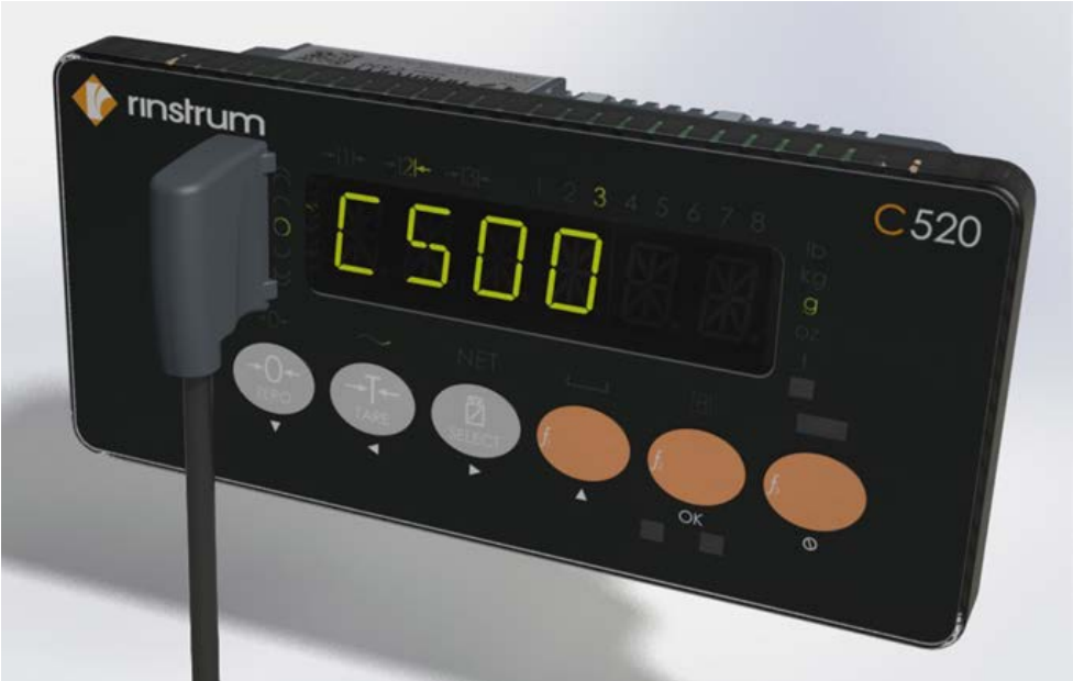
Rinstrum Model C520 Indicator (Variant 1)