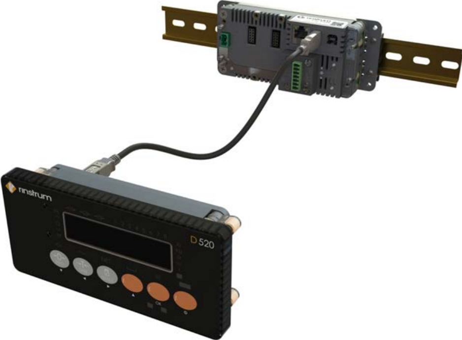
Rinstrum Model C530 Weighing Module with Remote display (Variant 2)