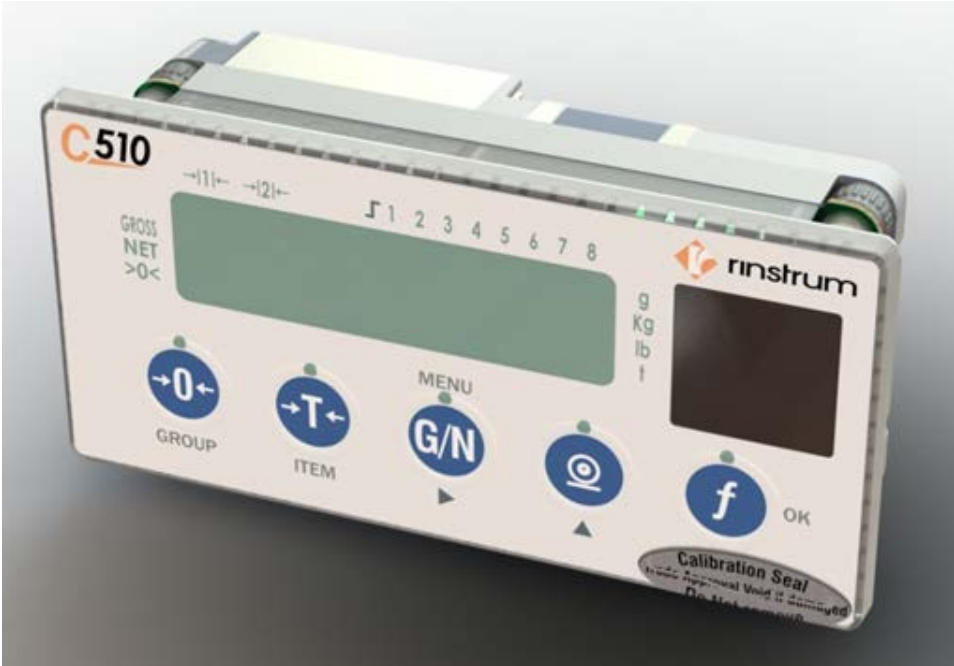
Rinstrum Model C510 Indicator (Pattern)