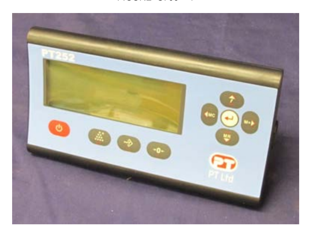
(a) PT Model PT252 Digital Indicator (pattern)