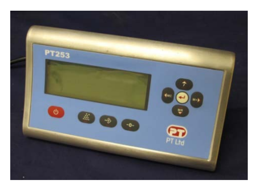
(b) PT Model PT253 Digital Indicator (variant 1)