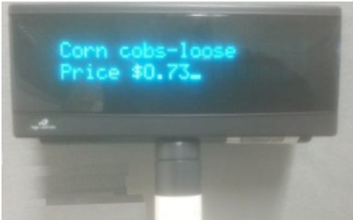
Typical Operator Display