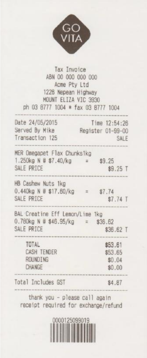
A Typical Receipt