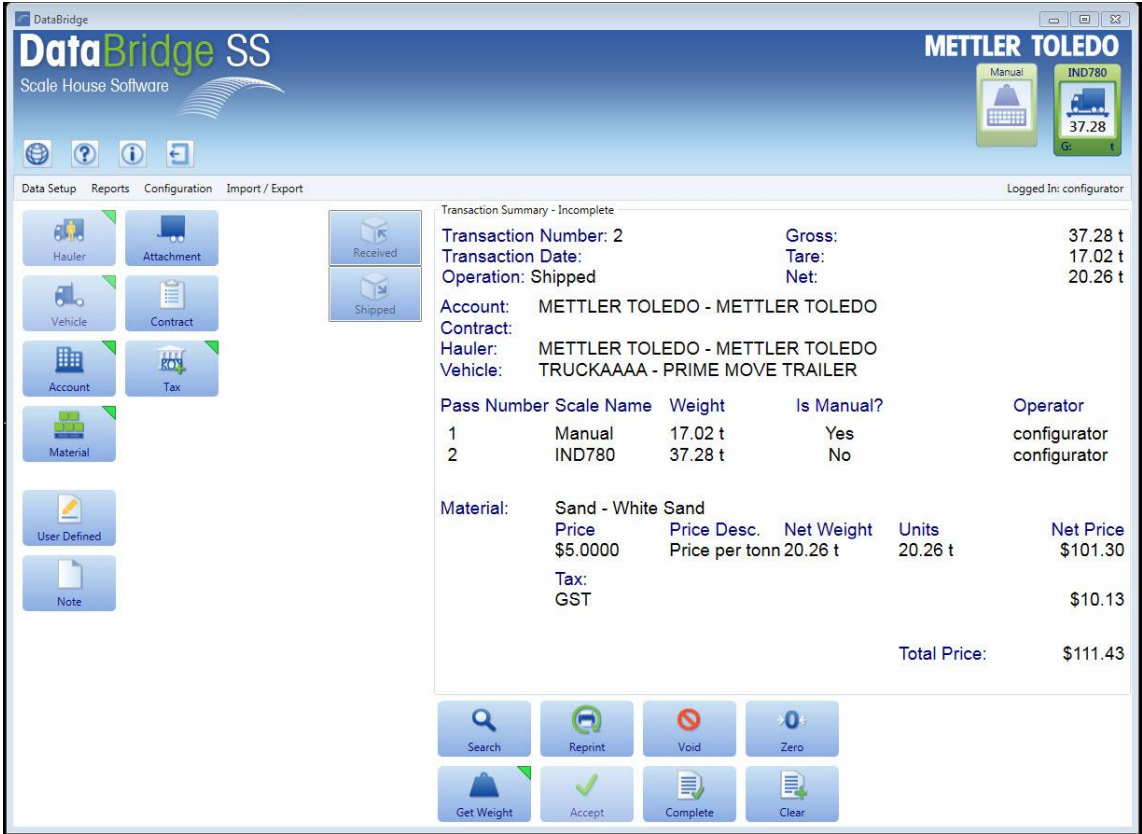
Typical Operator Display