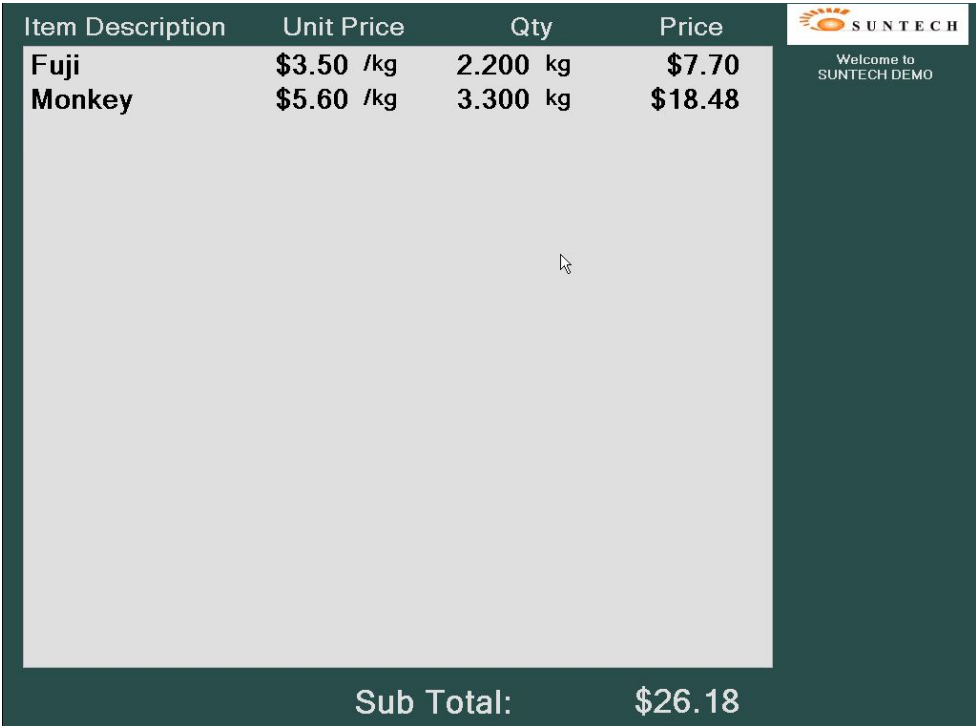
Typical Customer Display