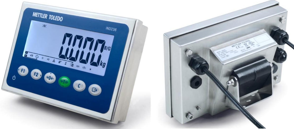
Mettler Toledo Model IND236 Digital Indicator