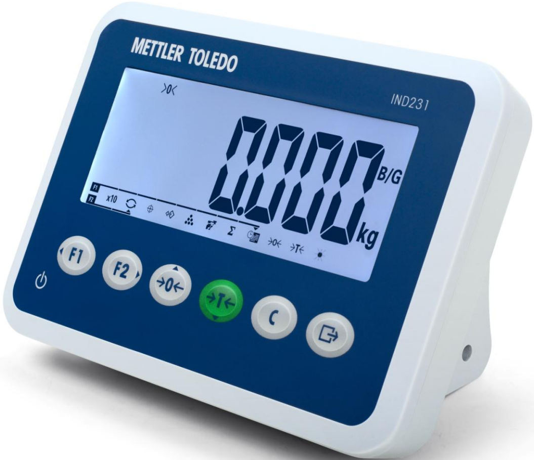
(a) Mettler Toledo Model IND231 Digital Indicator