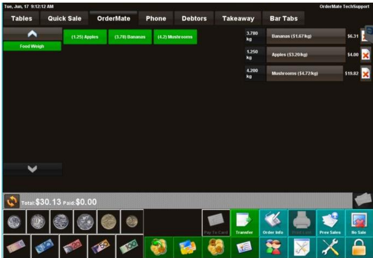
Typical Operator Display