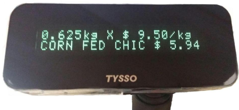
TYSSO Model VFD-950A Customer Display