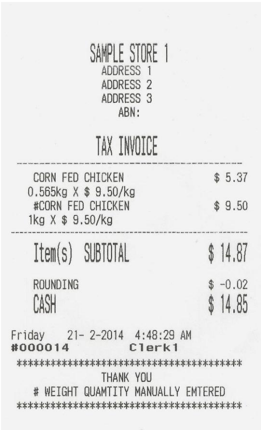
A Typical Receipt