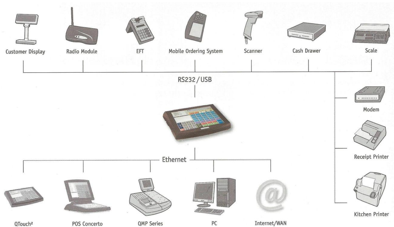
Typical QUORION Model QTouch 2 Point of Sale (POS) System