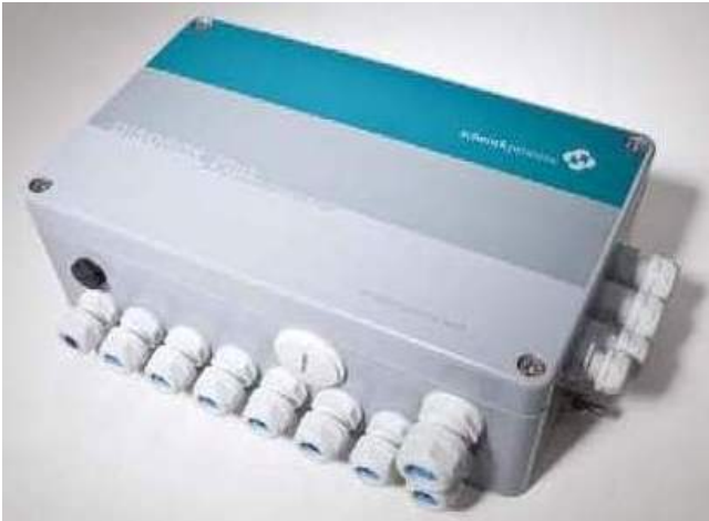
Schenck Model Disobox Plus VME2100 Analogue Data Processor