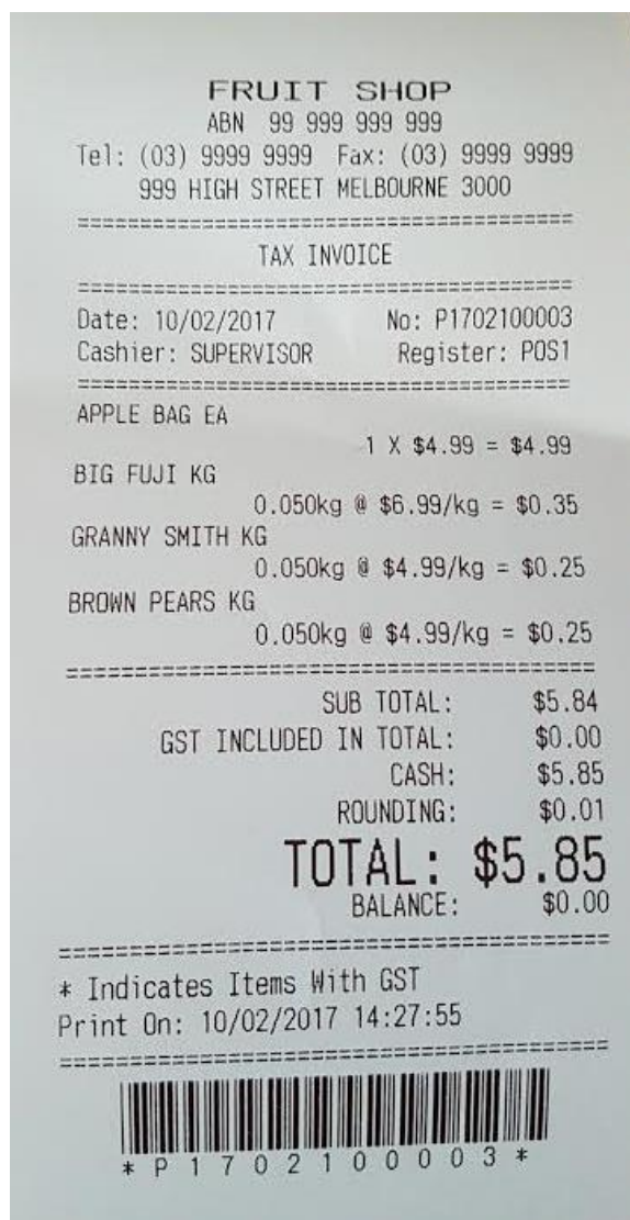
A Typical Receipt