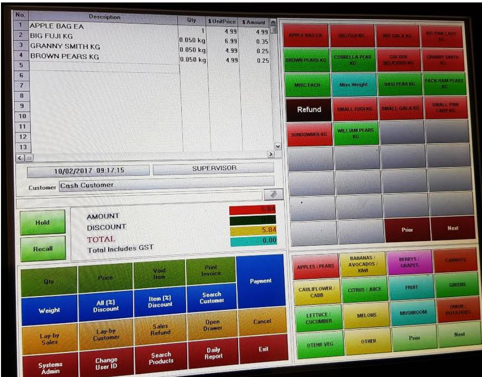
Typical Operator Display