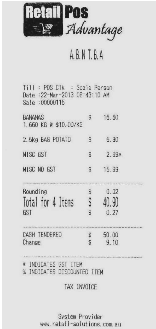
A Typical Receipt