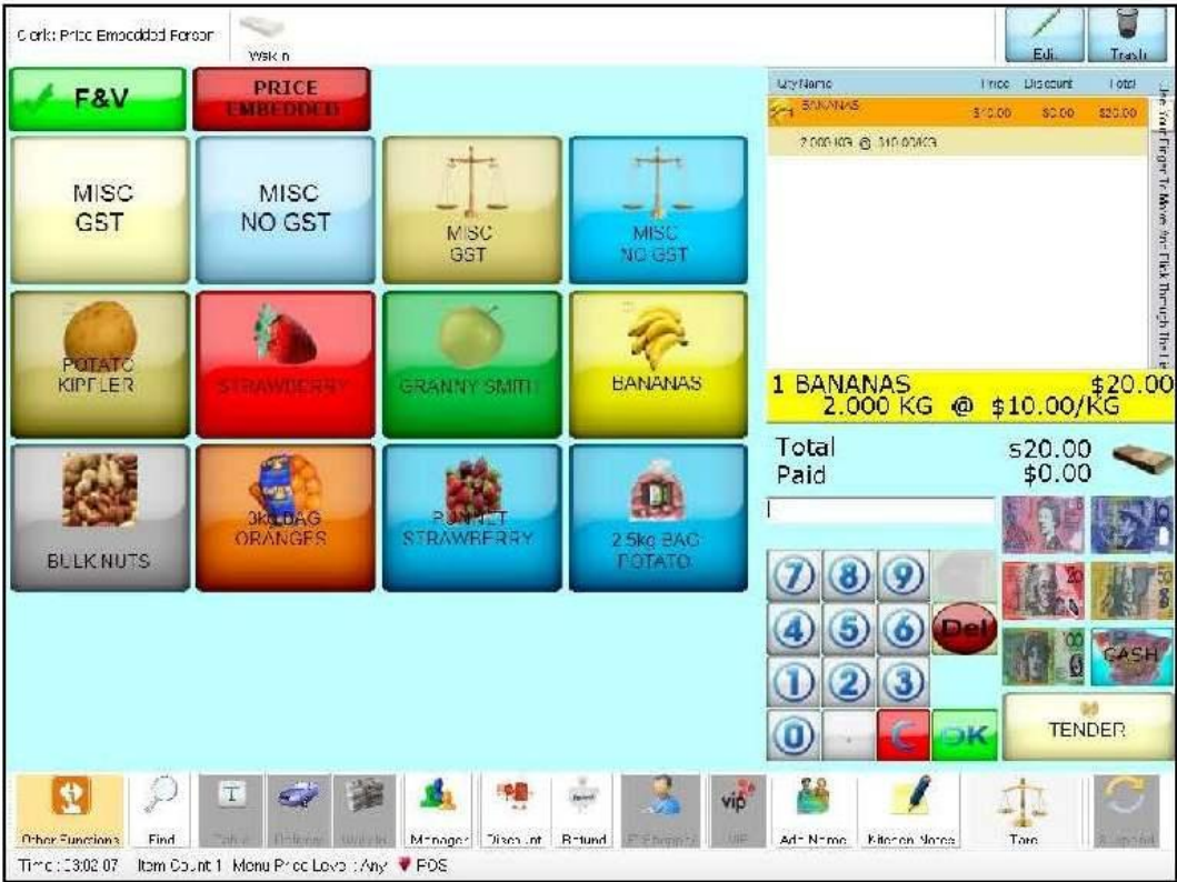
A Typical Operator Display