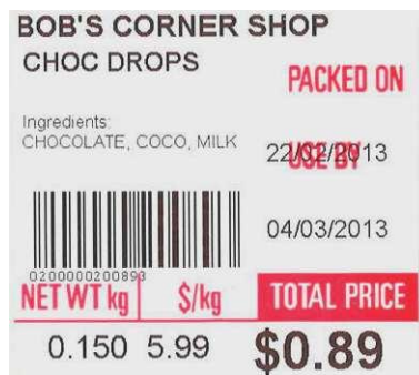
A Typical Label