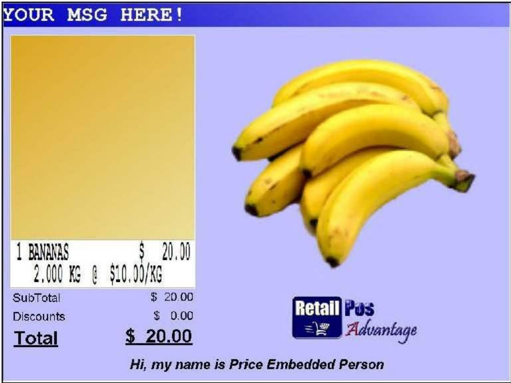
A Typical Customer Display