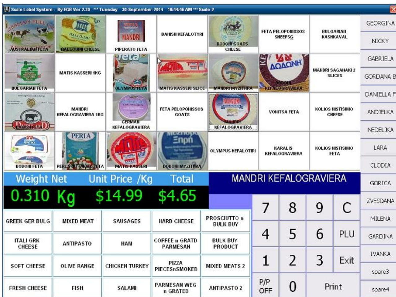
Typical Operator Display – Model Scale Label POS System (Variant 1)