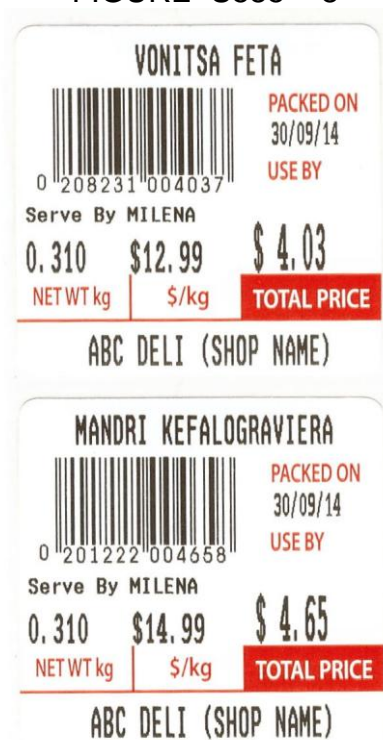
Typical Labels – Model Scale Label POS System (Variant 1)