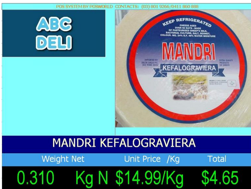
Typical Customer Display – Model Scale Label POS System (Variant 1)