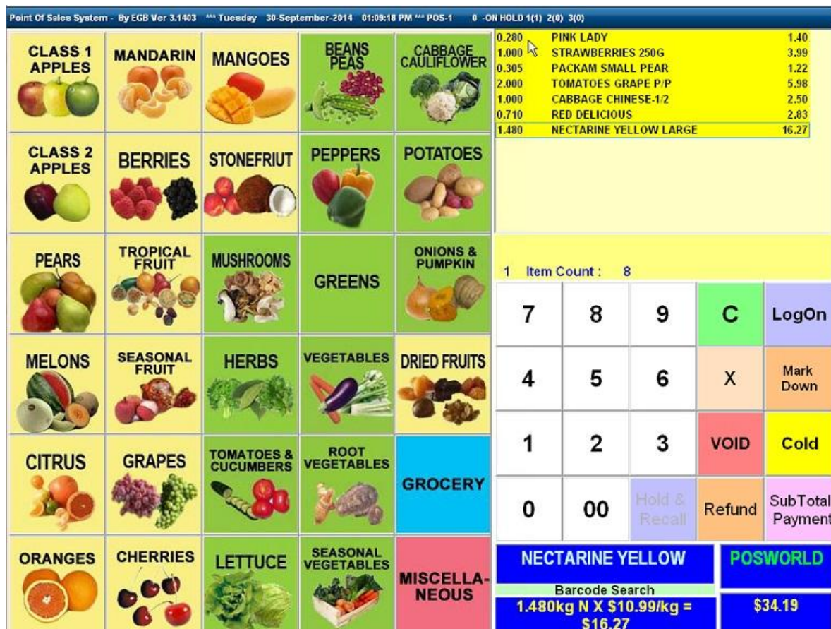
Typical Operator Display (Pattern)