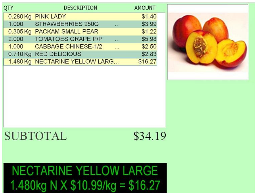
FIGURE S595 – 3