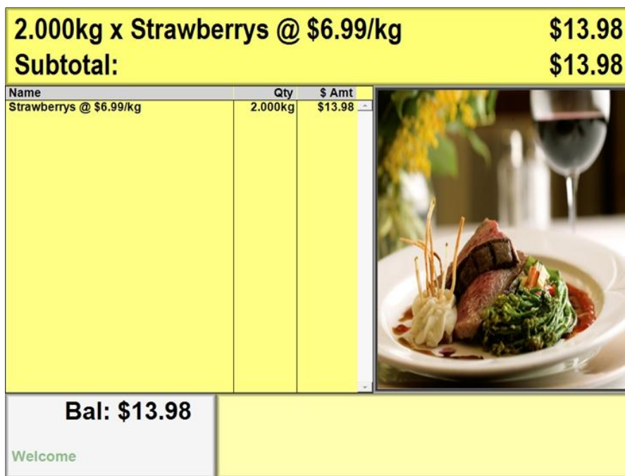
Typical Customer Display