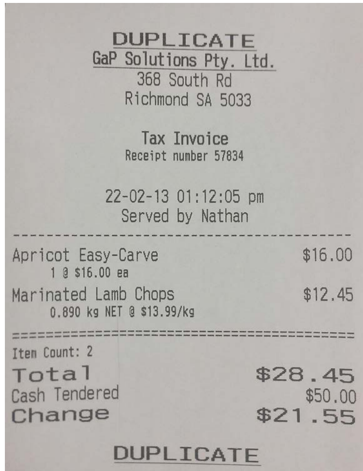
A Typical Receipt