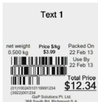
A Typical Label