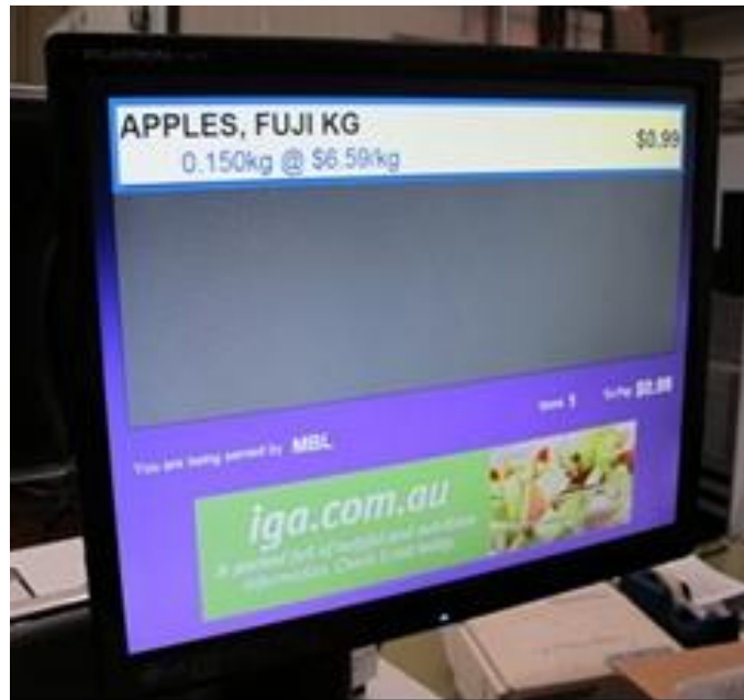
Typical Customer Display