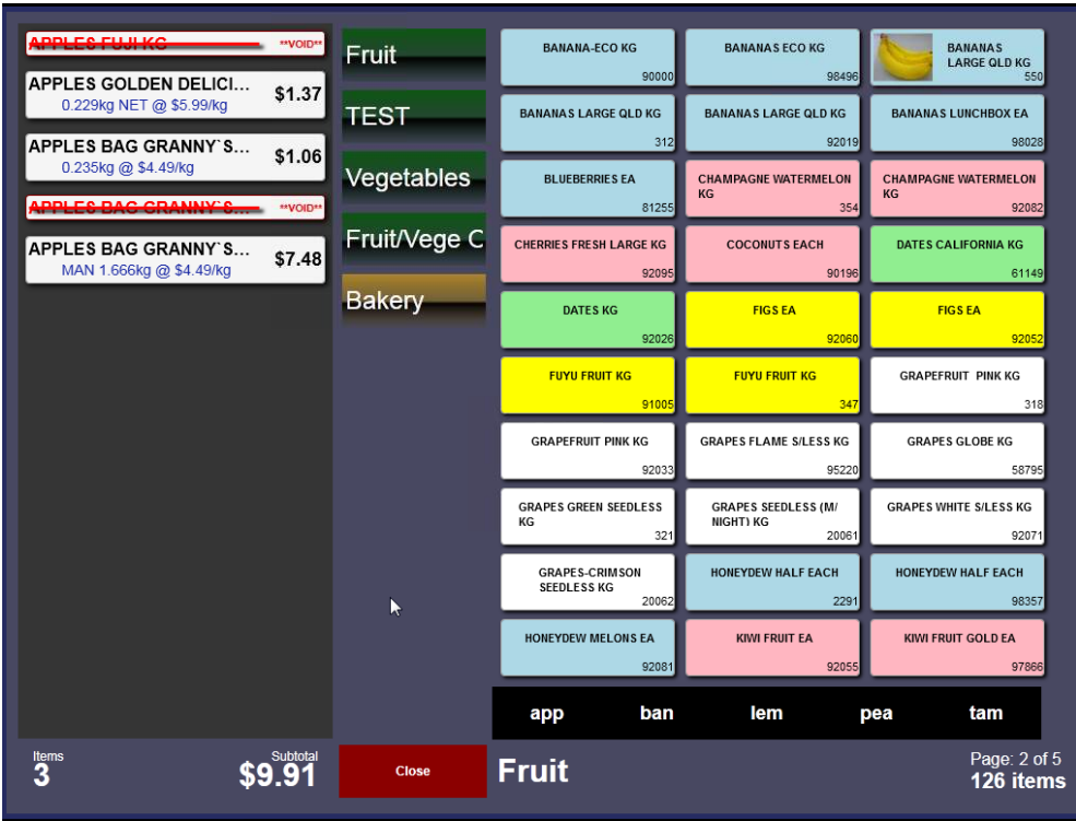
Typical Operator Display