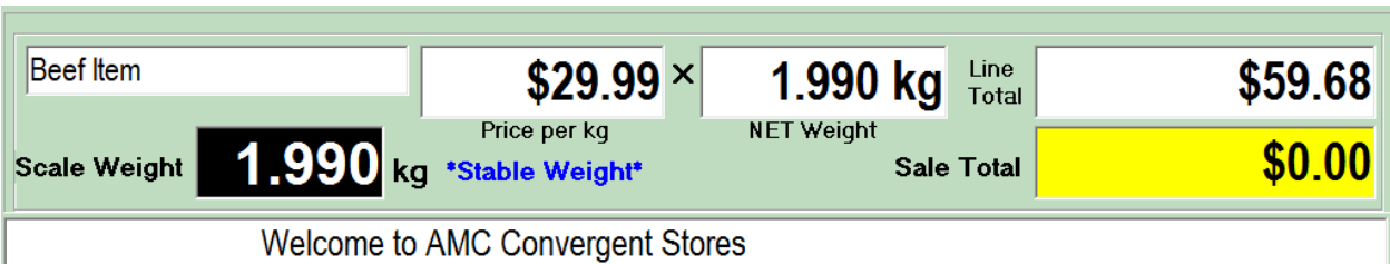
Typical Customer Display