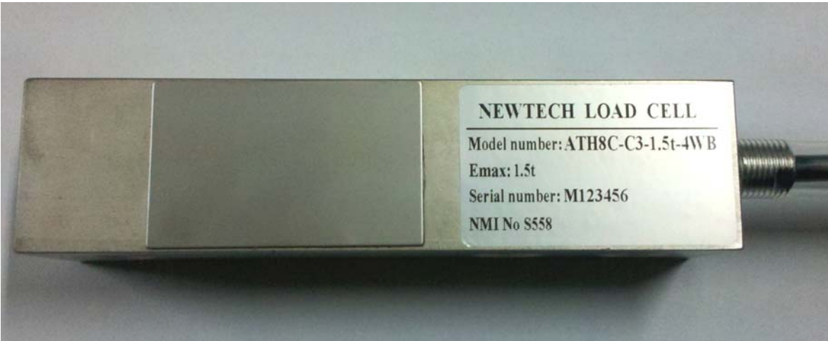
(a) Newtech Model ATH8C-C3-1.5t-4WB Load Cell