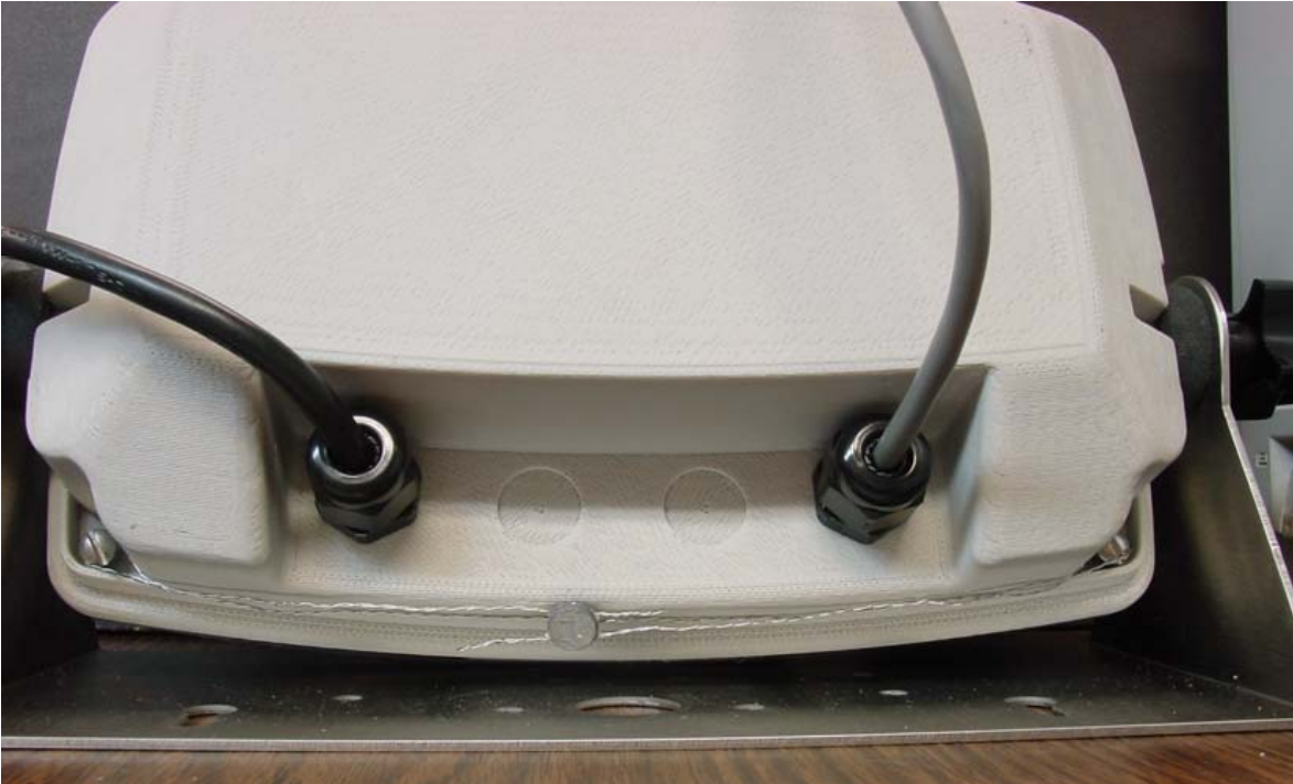
(b) Typical Sealing