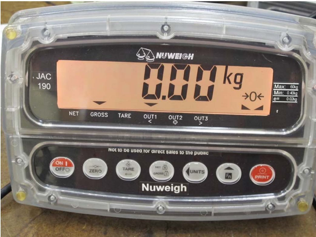
NUWEIGH Model JAC 190 Digital Indicator