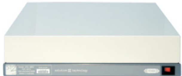
9650 Flowmeter Controller (front view)