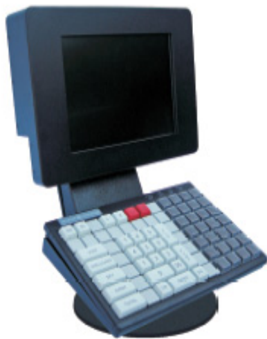
4650 Operator Console