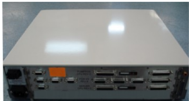
9650 Flowmeter Controller (rear view)