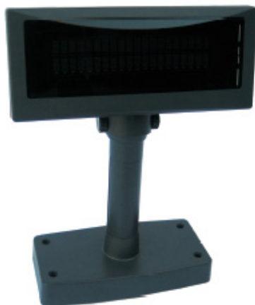
ICD2002 Customer Display