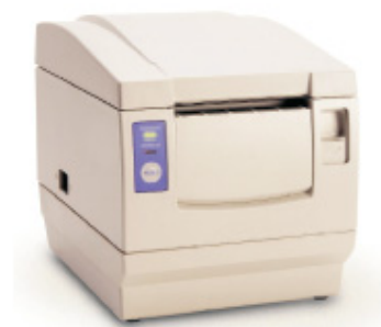
CBM1000 Receipt Printer