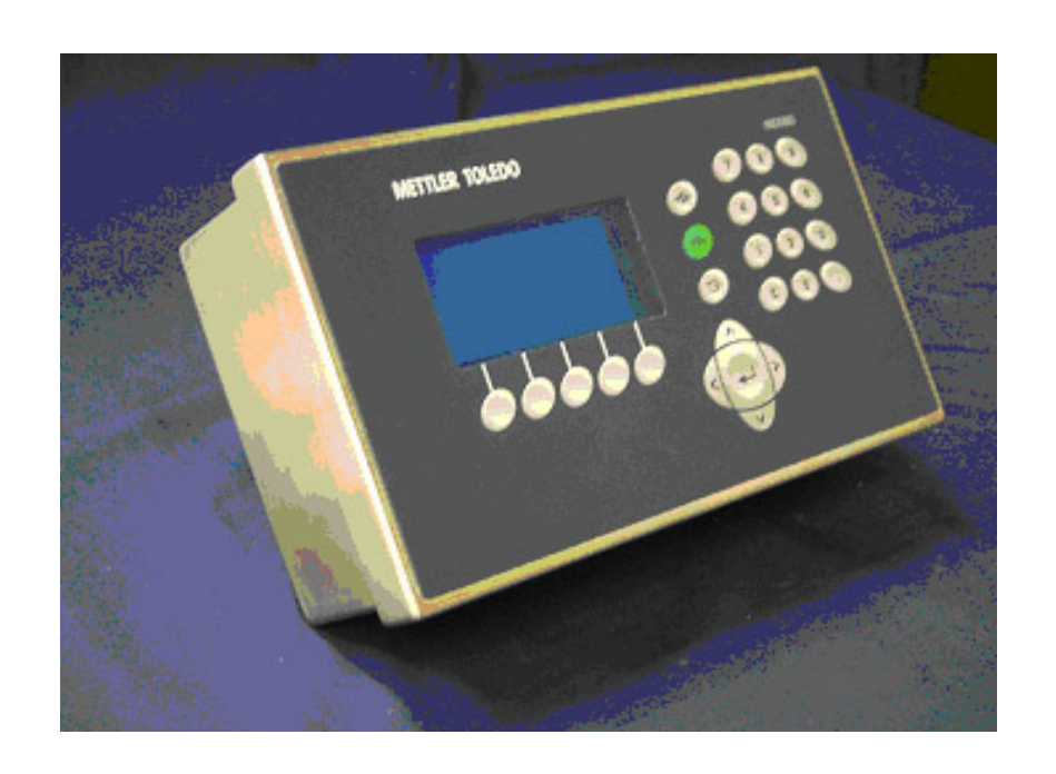
(b) Stainless steel ('Harsh') enclosure (variant 1)