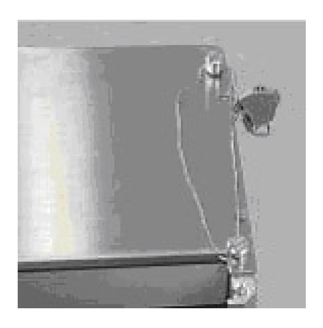
Typical Sealing Arrangement Using Lead and Wire Seals