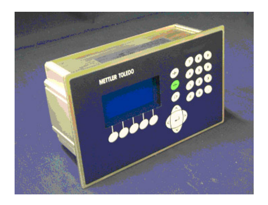
(a) Panel mount (the pattern)