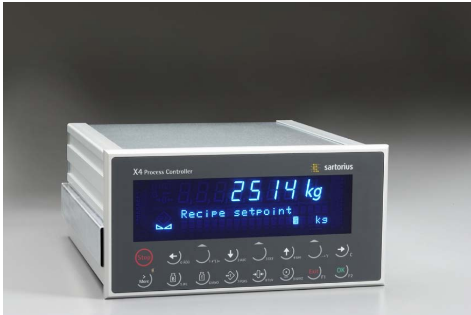
(a) Front View