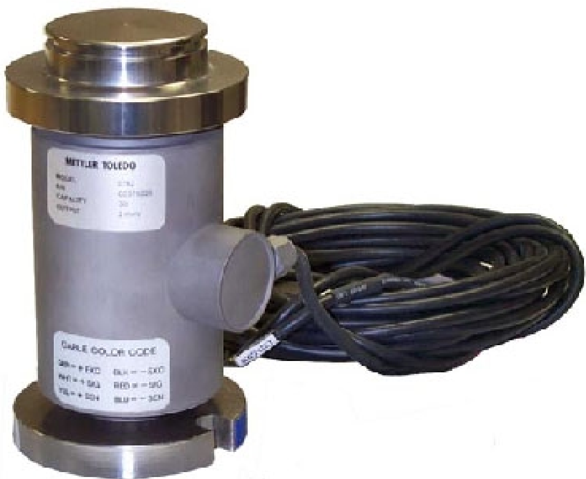
Typical Mettler-Toledo 0782 (GD) Series Load Cell With Mounting Fittings