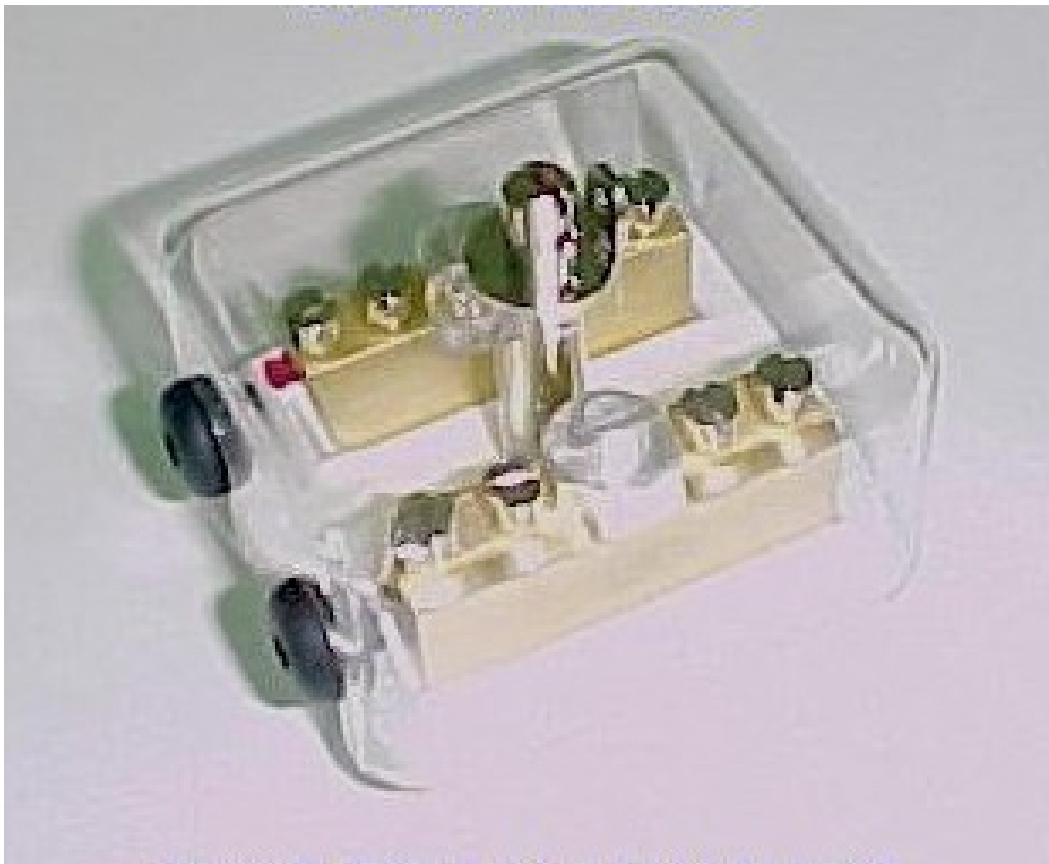
Showing Brass Tunnel Terminals