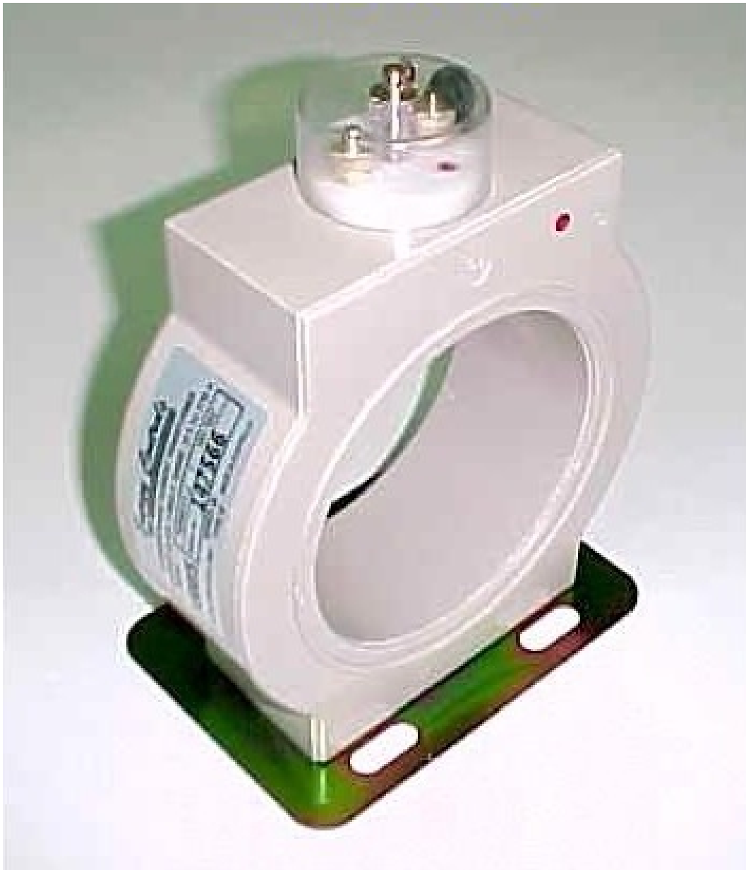
WF Energy Controls Model W Current Transformer