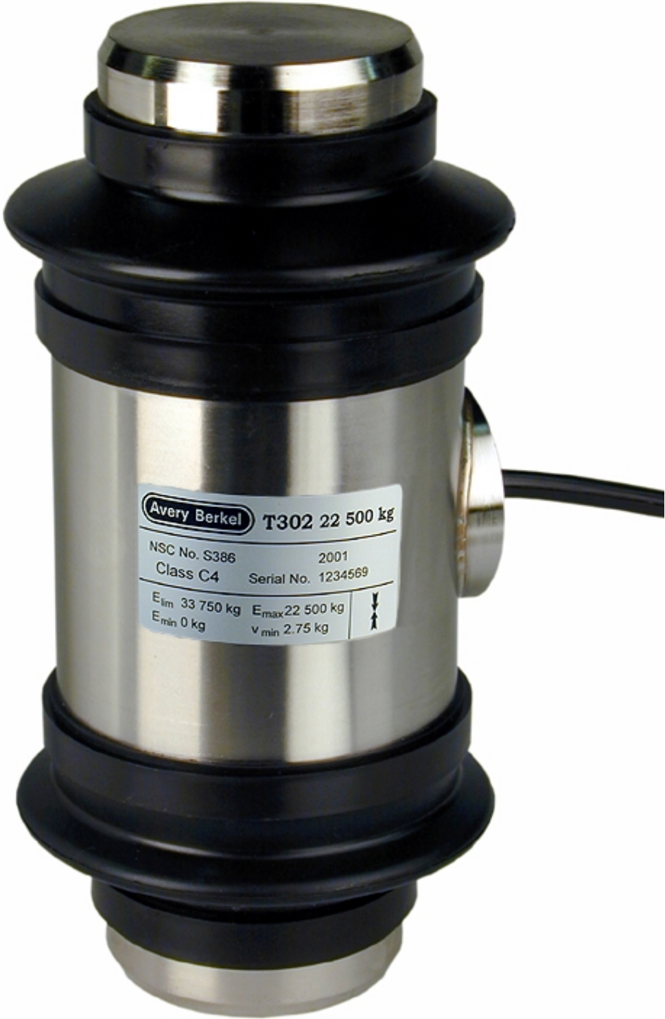
Typical Avery Berkel T302 Load Cell