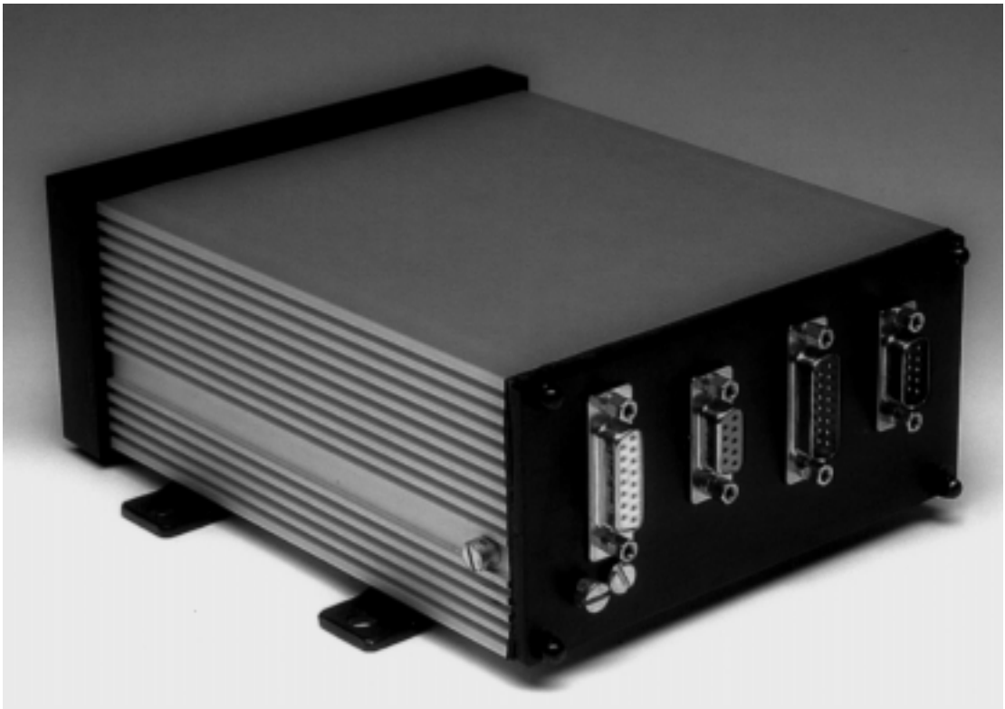
Showing Sealing Screws