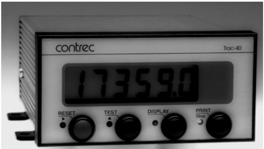
Contrec Model Trac-40 Calculator/Indicator