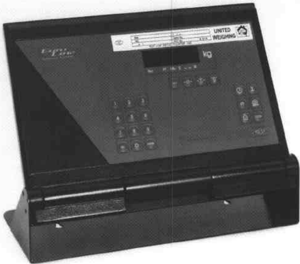
Molen Model Simecs T/2000 Digital Indicator