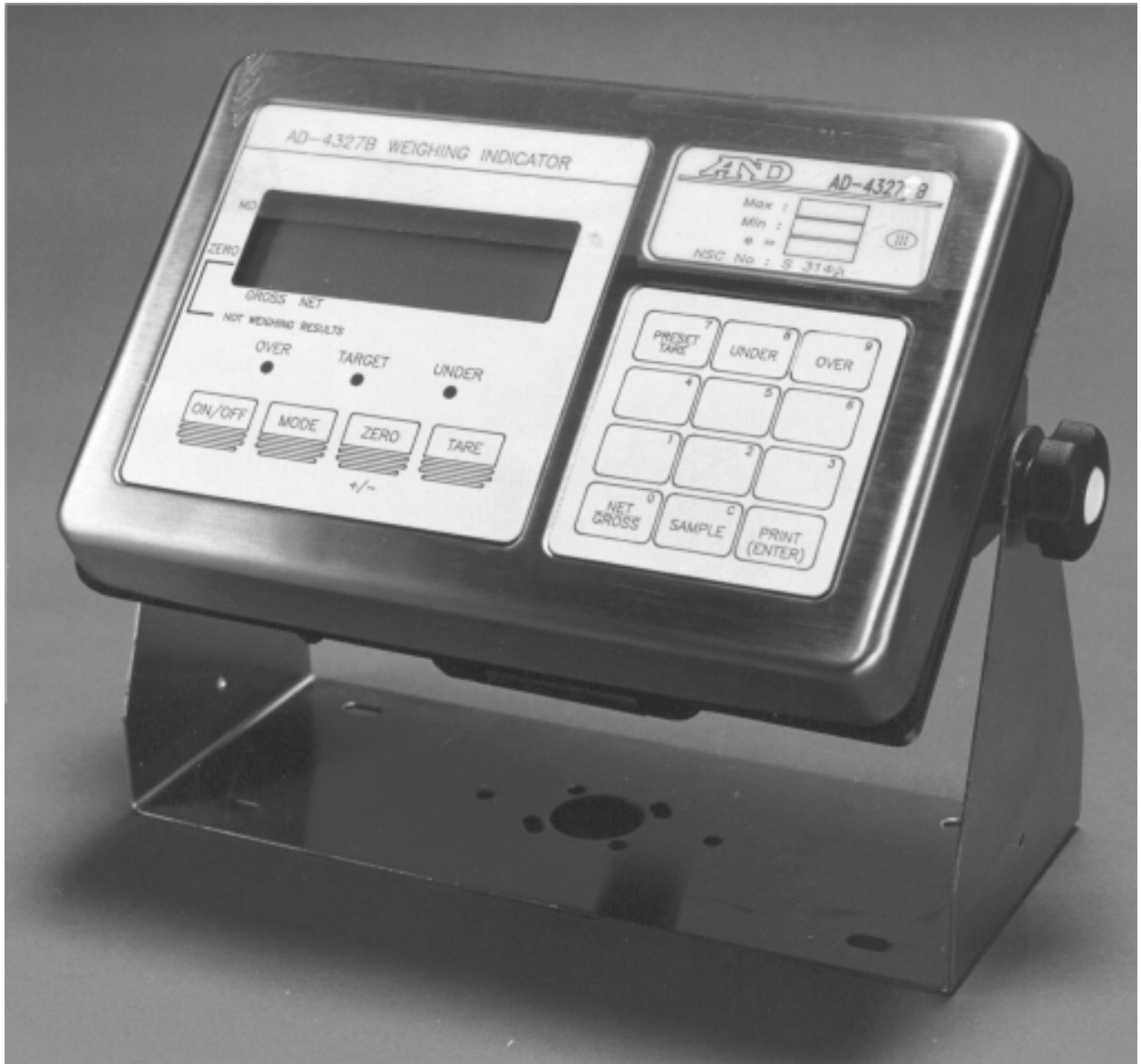
A & D Mercury Model AD-4327B Digital Indicator