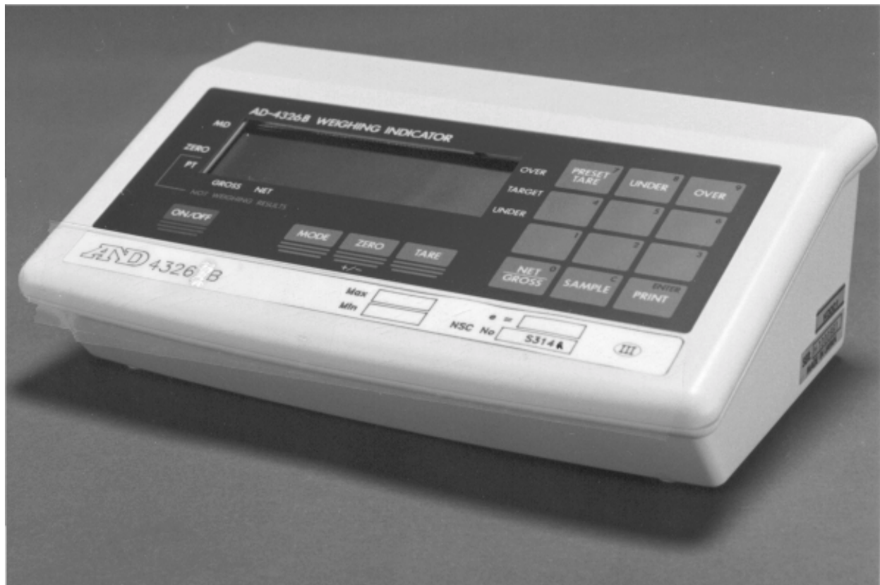
A & D Mercury Model AD-4326B Digital Indicator