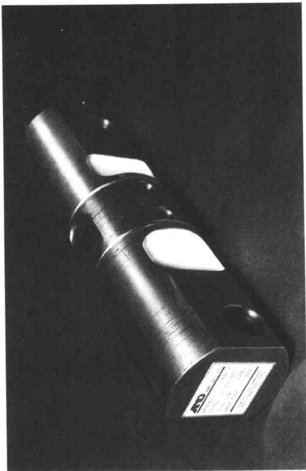
AND Model LC5217 Load Cell