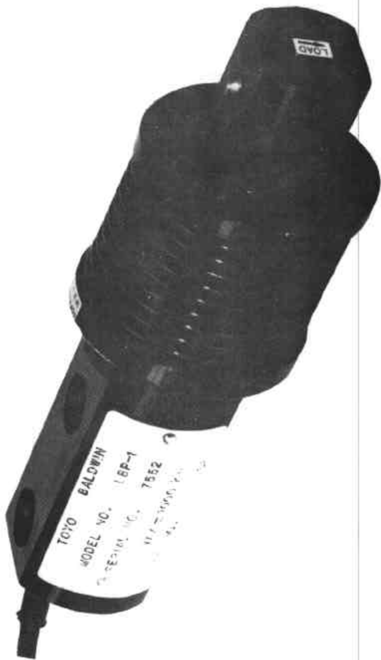
Toyo Baldwin LBP-1 Load Cell