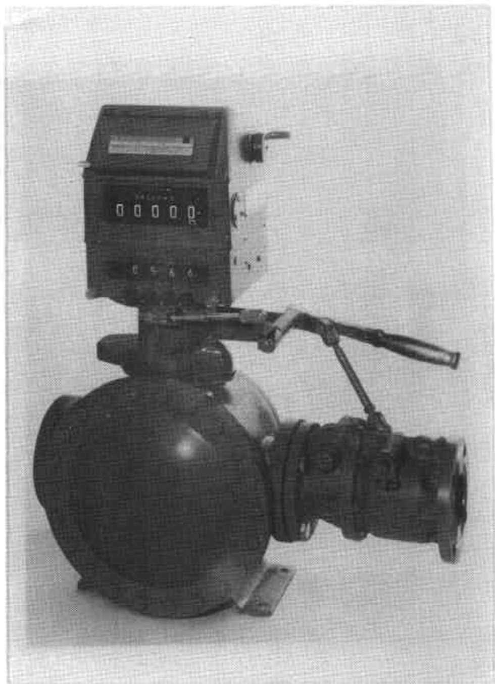
An Alternative B-70 Series Arrangement