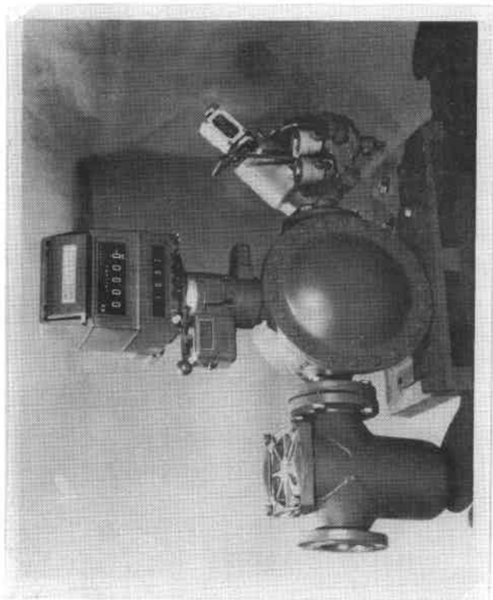
Brooks B-70 Series Flowmeter Including Strainer (Without Gas Separator)