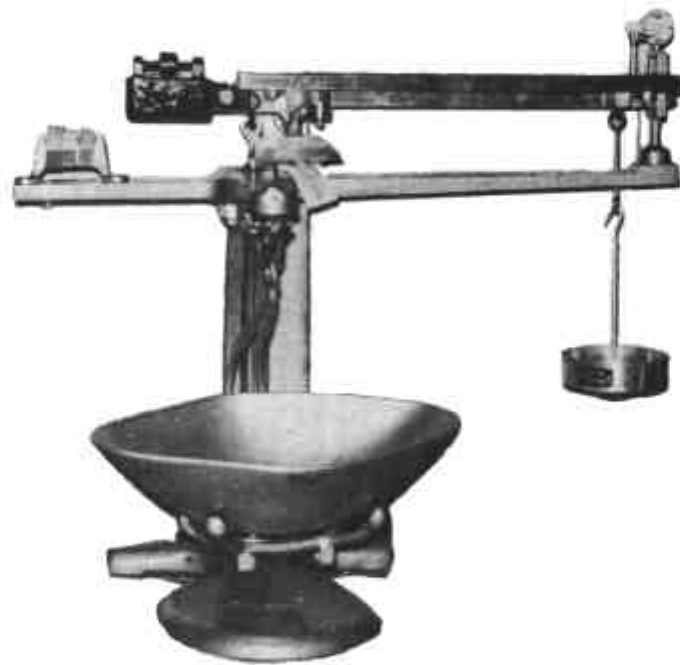
J. W. Wedderburn Weighing and Counting Machine Model A2