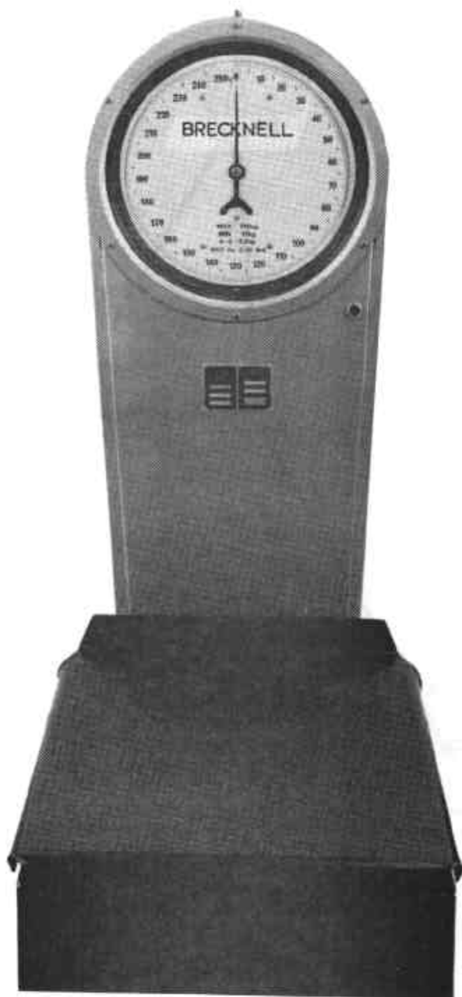
Brecknell 552 CUB Weighing Instrument