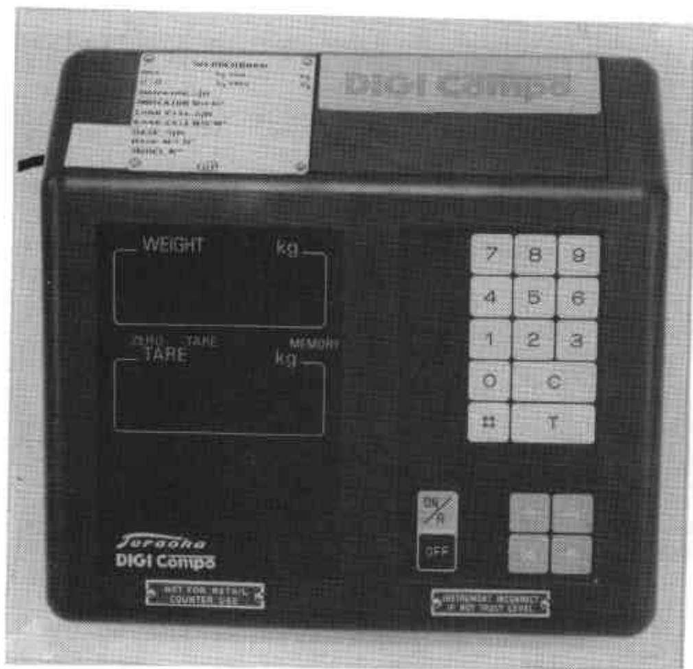
Terooka DS-260 Indicator