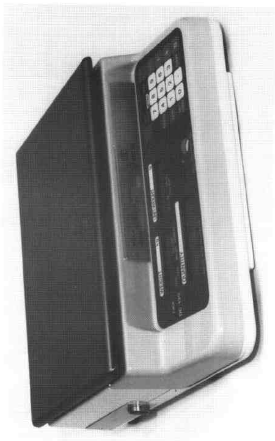
Teraoka Seiko Model DC-130 Weighing Instrument