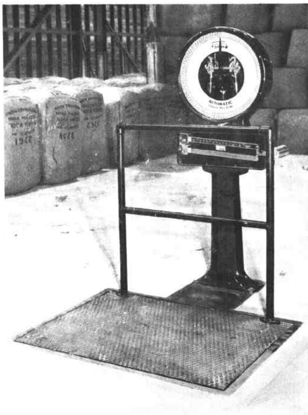
Fairway Dormant Platform Scale