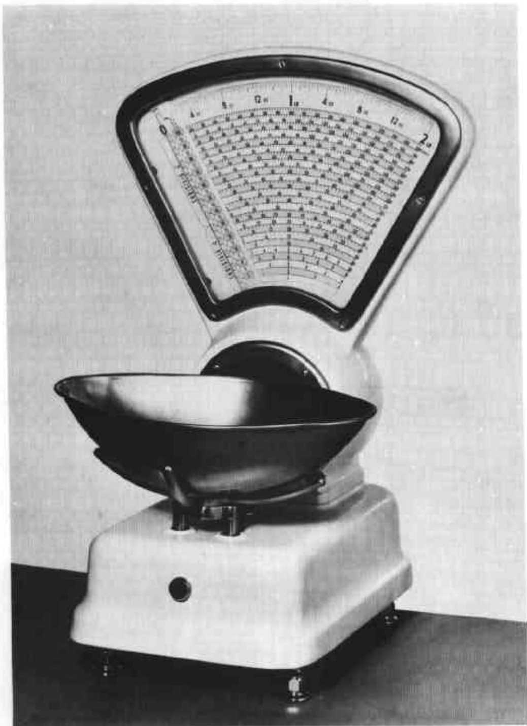
Quality Model 322