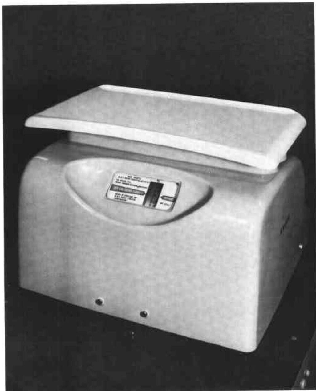
Avery 1214 — Customer's Side