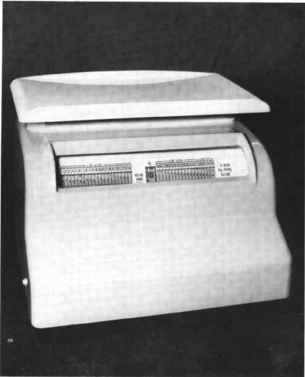
Avery 1214 — Vendor's Side