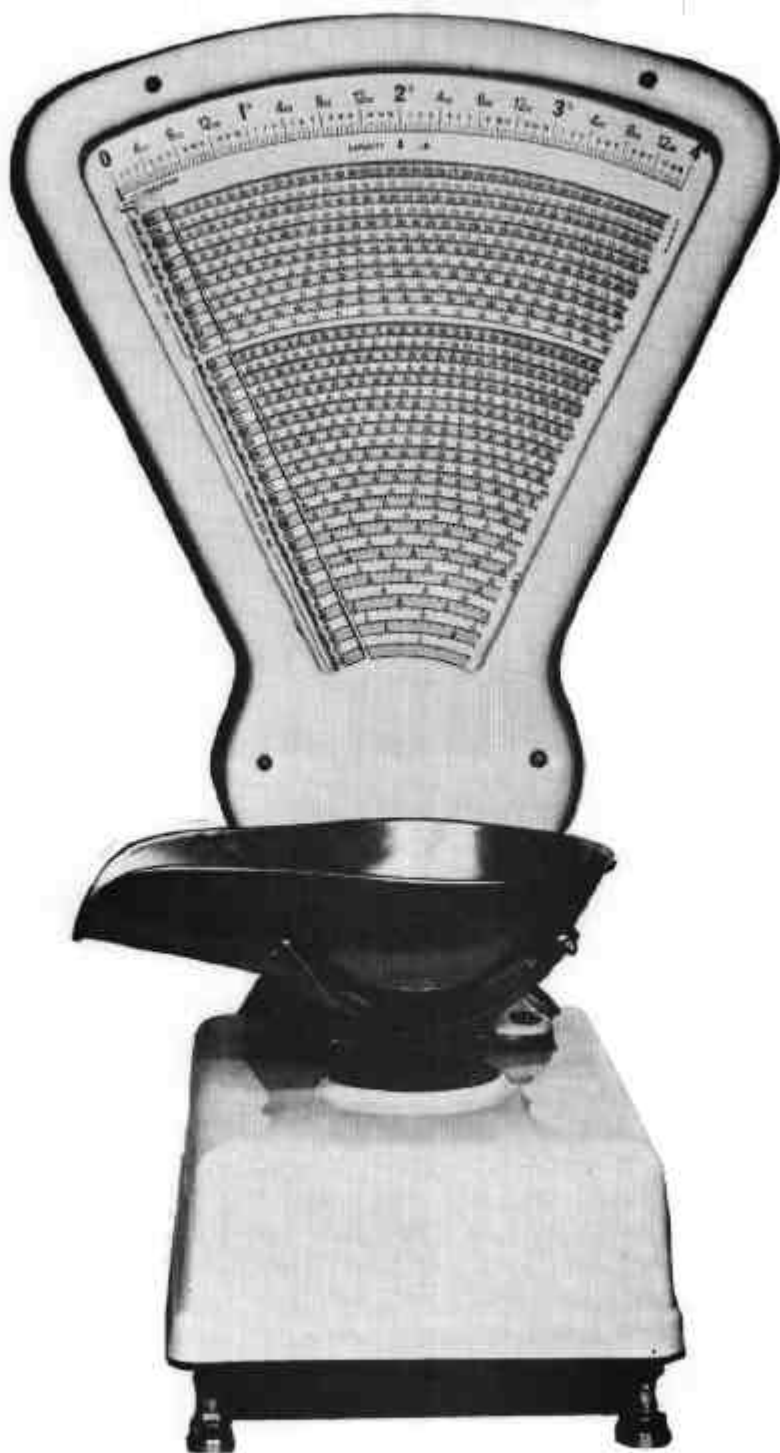
Victoria Model GW4