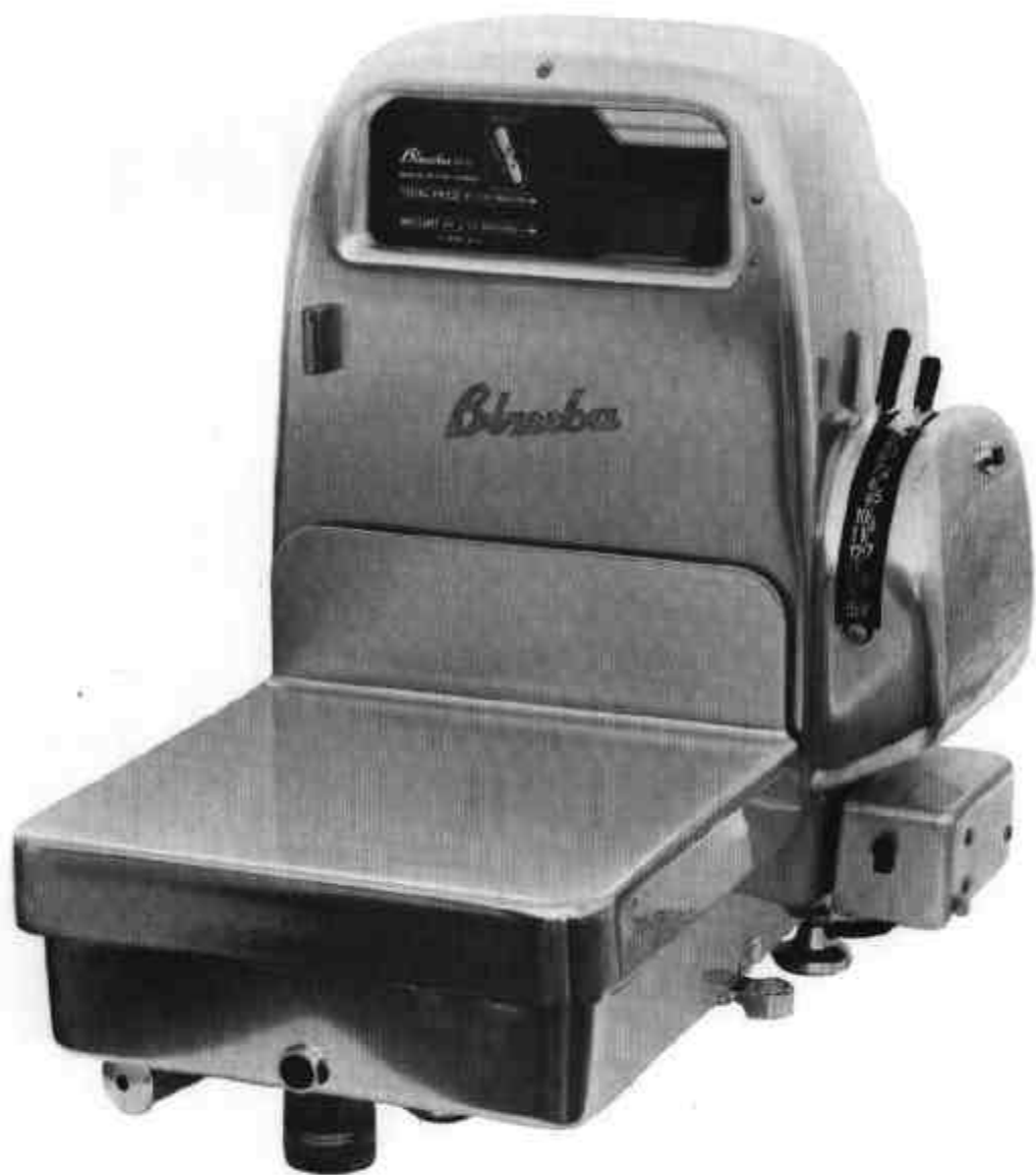
Bizerba OP 15